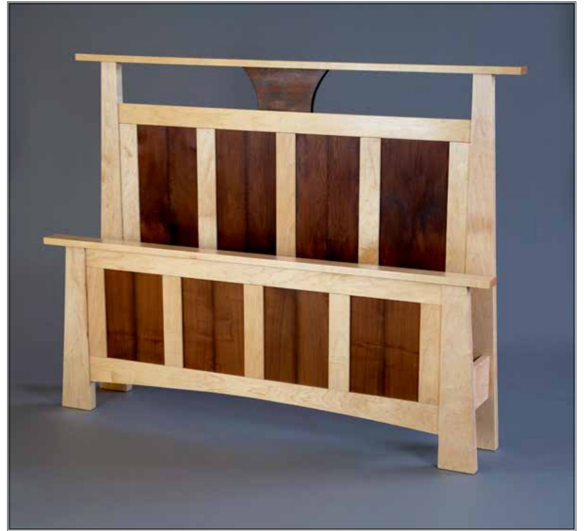
Old Growth Redwood and Eastern Maple Bed by Jennifer Larocque