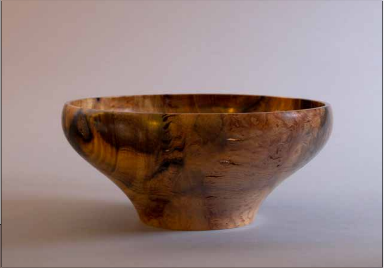
Big Zipper by Les Cizek