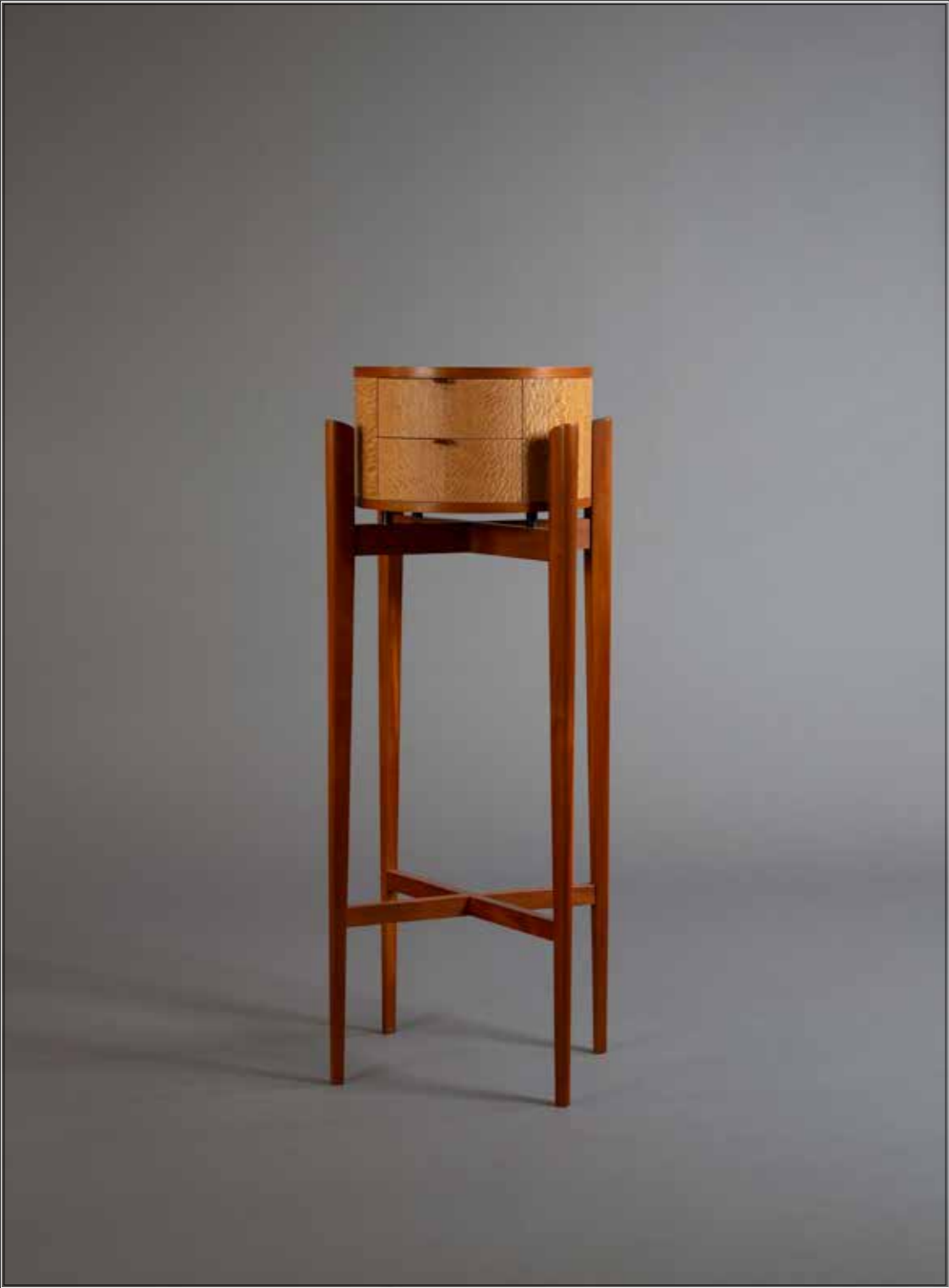
Beauty 360 by Lucinda Daly