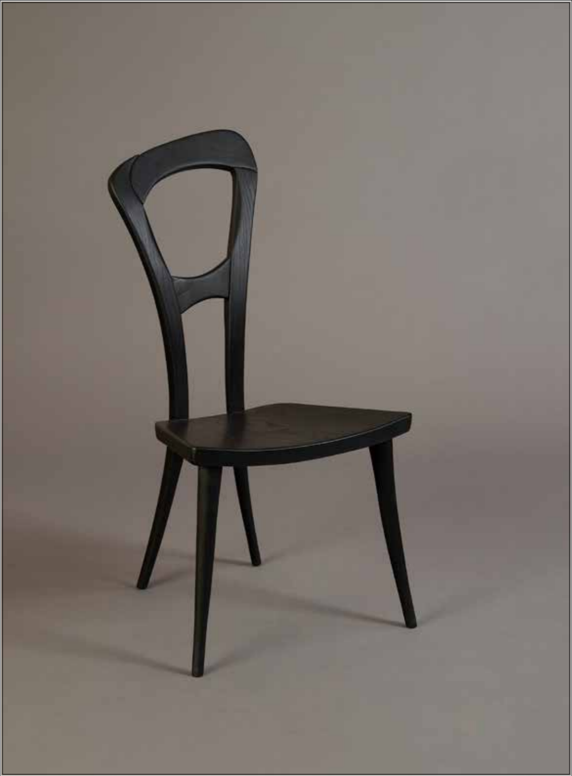
Black Beauty by Lucinda Daly