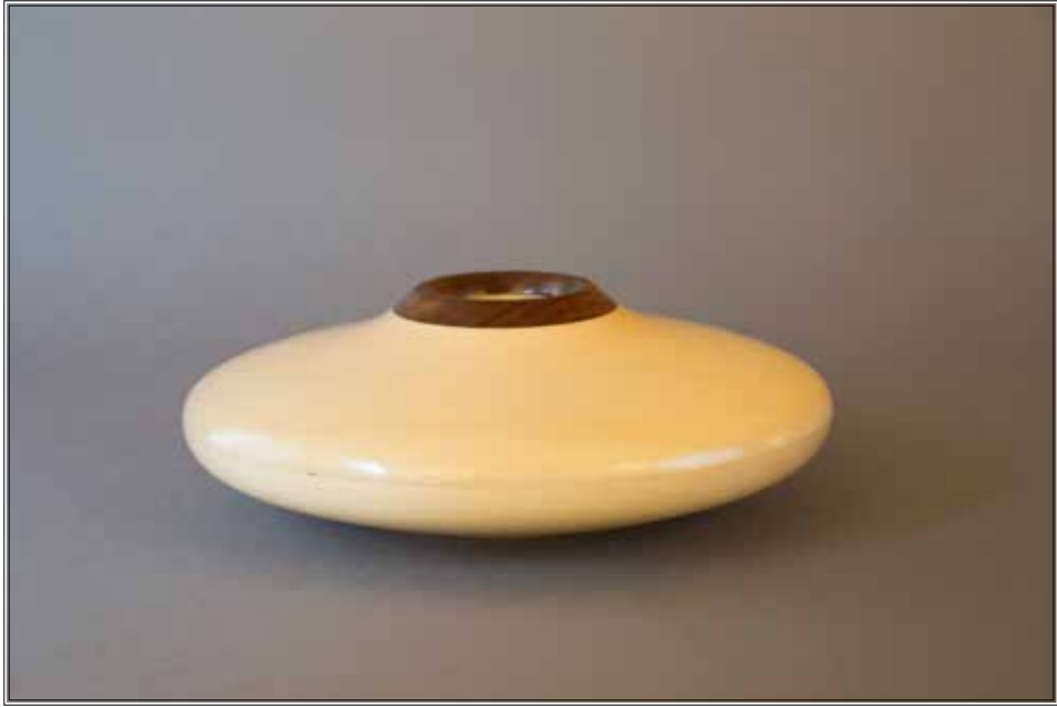
Bubbles by Les Cizek