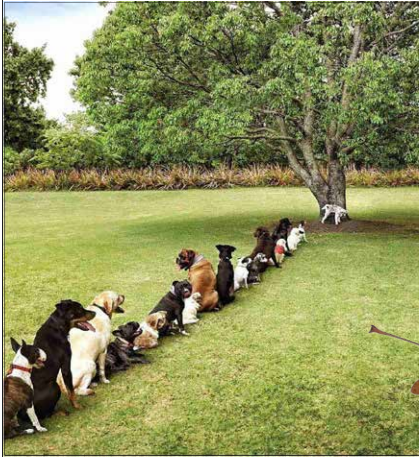
Another reason we need more trees

California's Arbor Day is celebrated on March 7, in honor of renowned horticulturist Luther Burbank's birthday (March 7, 1849-April 11, 1926).