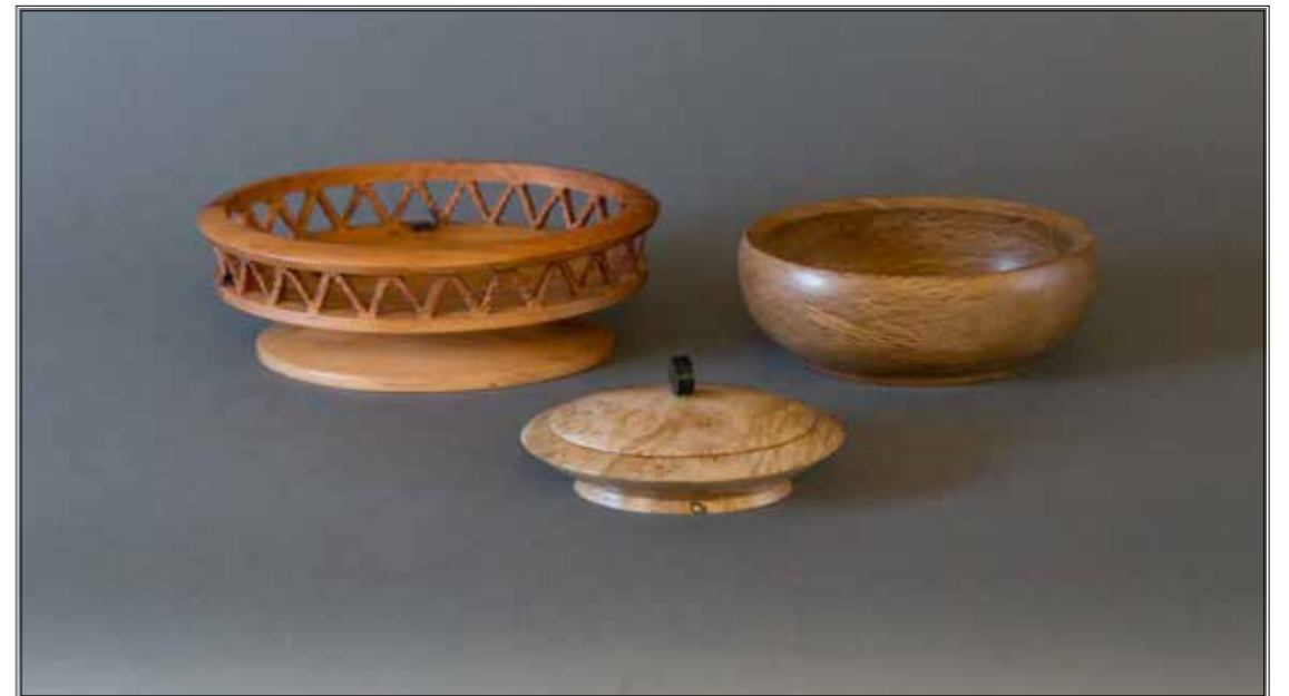
Oval Turnings by Warren Glass