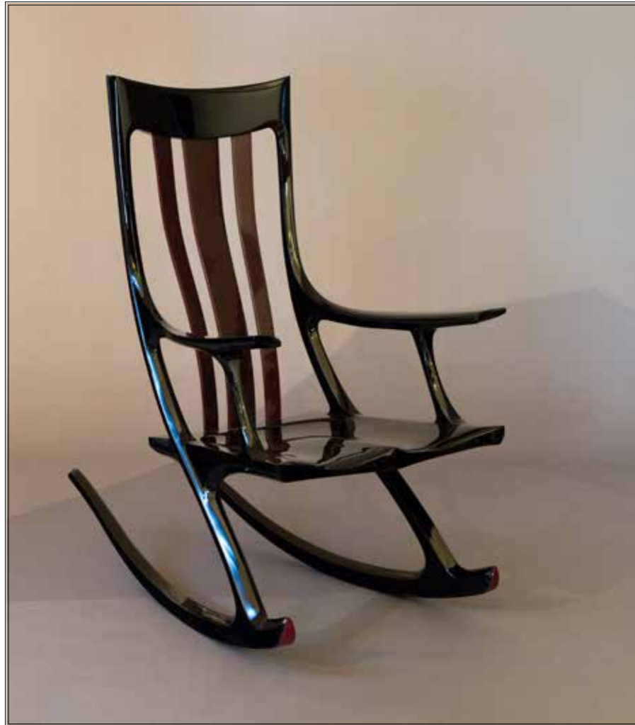
Lady Gaga Rocker by Dugan Essick

Dugan also entered another chair, this one a rocker made of marine mahogany plywood. The main structure is two layers of 3/4" ply and one 1/4" ply, with a 1/4" thick plate of carbon fiber and epoxy buried inside. He showed us a piece of the carbon fiber, and this writer can attest to its rigidity (for more on this subject, check out the Wood Forum , June 2016, https://tinyurl.com/Jun16WF page 9). It's like steel, but at a small fraction of the weight.