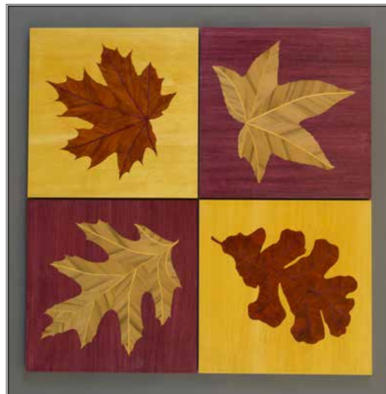
Four by Bill Taft

Bill Taft had two entries in the Show this year. One, Crabby , was Bill's first venture into mosaic marquetry. His other entry, simply called Four , was so named because it comprises four panels, four different leaves, and four different woods (purpleheart, yellowheart, green poplar, and padauk). As Bill pointed out, for the Show the four panels were arranged in a square, but they could just as easily be arranged in a horizontal row, a column, a diamond, or whatever a person wanted. He made the four panels as separate elements for the very practical reason that each was the maximum size that could be worked in his 16" scroll saw. Bill uses a piece of throw-away plywood as a "construct" to cut out and assemble the bits of veneer that will become the picture; as he cuts out each element he simultaneously is cutting the same shape out of the plywood, so that when the last piece is glued in, the plywood is gone. Using a well-tuned tablesaw, Bill saws his own 1/8" veneer from lumber, a technique he settled on 10~12 years ago when he began doing marquetry.