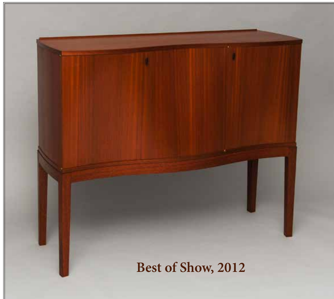
Best of Show, 2012

The 25th Annual Artistry in Wood Show opens Saturday, September 21st and runs through Sunday, October 20th at the Sonoma County Museum. The museum is open from 11 am to 5 pm, Tuesday through Sunday. The Sonoma County Museum is located at 425 Seventh St., in central Santa Rosa. The phone number is (707) 579-1500.