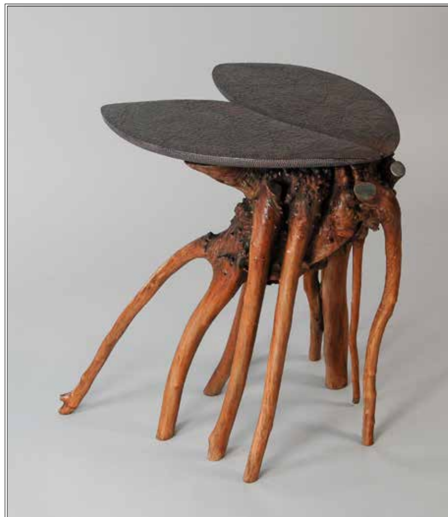
Fly Table by Michael Cullen

Bill Taft moved that the show meeting with judges be moved back by three weeks to September 18. The motion was carried by acclamation.