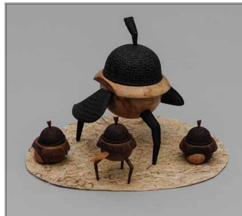
Box Hen with Chicks