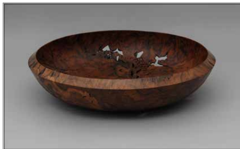
Fenestrated Black Walnut Bowl by Chuck Quibell