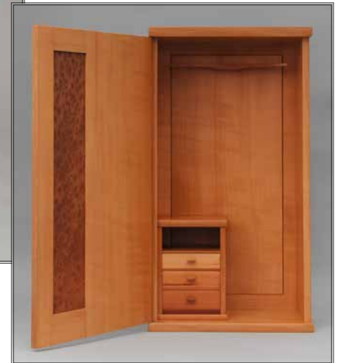
Madrona