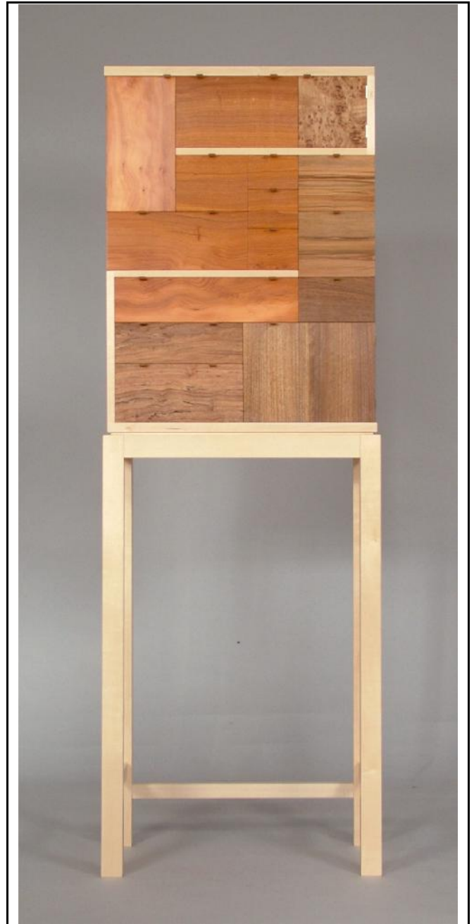
Patchwork Cabinet 2