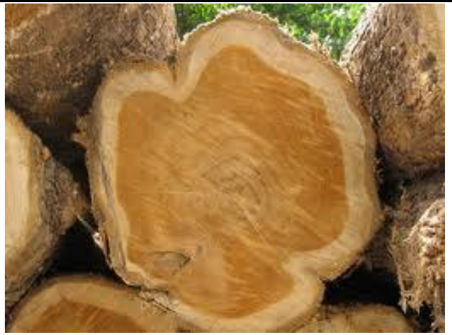
Old Growth Teak Logs

Most of the old growth material goes into veneers and is rarely available as lumber.