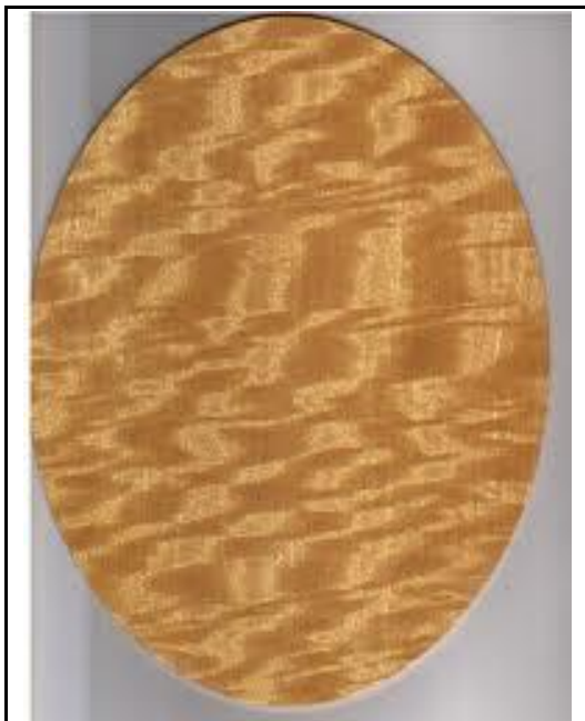
Satinwood Table: Genuine or Imposter?

There are at least 38 species from 25 genera that have the word satinwood as all or part of one or more of their common names. The two species that are most often denoted as “genuine” satinwood are West Indian Satinwood ( Zanthoxylum flavum ) which grows on many Caribbean islands (and even some of the Florida Keys), and East Indian Satinwood ( Chloroxylon swietenia ) which comes primarily from Sri Lanka. Both species are members of the Rutaceae family which includes citrus. The woods of the two species are indistinguishable without a high-powered lens.