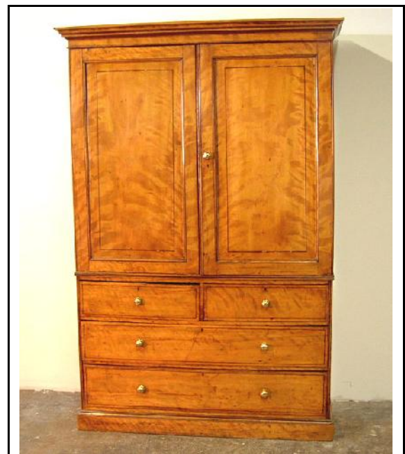
Satinwood Armoire, c. 1890

The chances are that the average woodworker will ever learn the true identity of the satinwood he acquires - another example of the wood business being run by marketers rather than scientists.