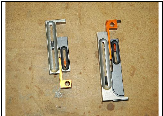
Kerf & Tenon Tools