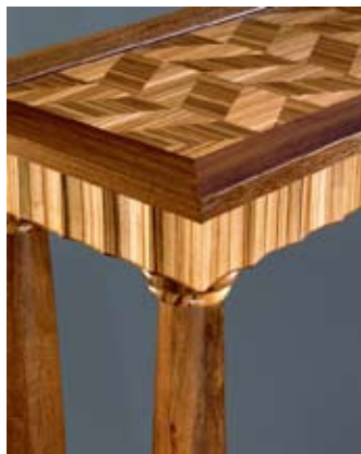
Table with inlay