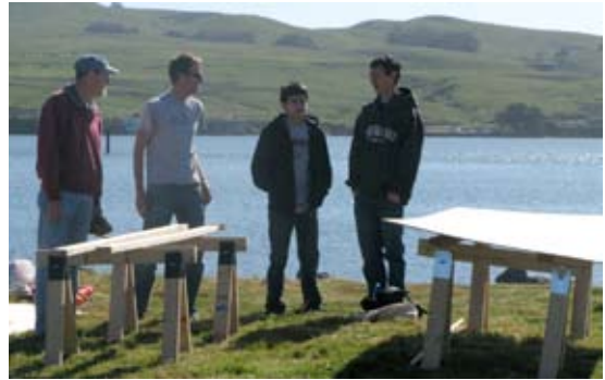
Wood Ducks I Team before the start