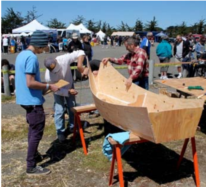
Wood Ducks II team nearing completion

The remarkable thing is that he screwed the plywood sides (one thickness) right into the bottom; no furring strip at all, just plywood butted and screwed into plywood, a fair amount of caulk, and some bracing. They wisely left a bit of margin for themselves in attaching the plywood, enough to trim back with saws and block planes. But the thing held well enough for Dan, who is lean and tough, to paddle kayak-style and come in first at the finish line, a good four lengths ahead of the nearest competitor. Kudos to both of them. Tom said that he thought the boat should last about as long as maybe a Dixie Cup, and by any measure, he succeeded.